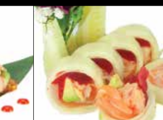
Perfect Naruto Roll