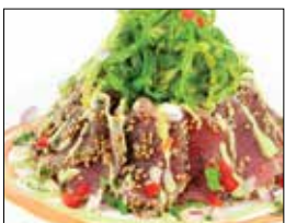
Pan Seared Tuna w. Soba Noodles