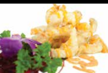
Spicy Rock Shrimp