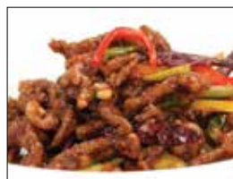
Szechuan Pepper Corn Beef