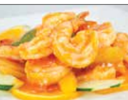
Mild Mango Jumbo Shrimp