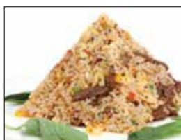
Malaysia Fried Rice