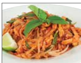
Chicken Pad Thai