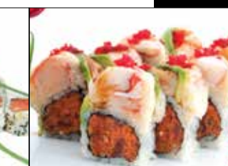
Fancy Lobster Roll